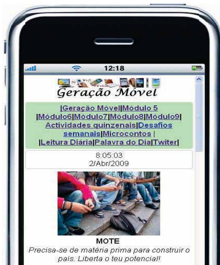
Fig. 2. Mobile Generation Website Project

learning. Throughout all the process, we have tried to develop students' ability to create their own contents, build knowledge and respect for the learning speed of each student.