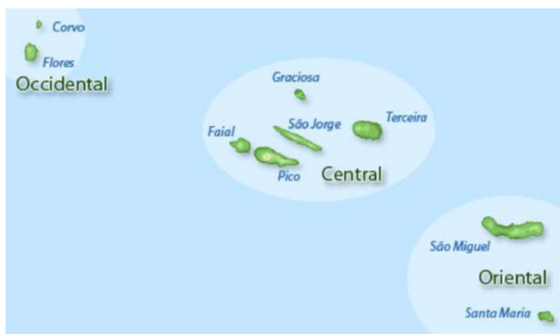
Figure 1 - Autonomous Region of the Azores

The Azores is an archipelago which, although situated precisely on the "Atlantic Middrop", due to its proximity to the European continent and its political integration into the Portuguese Republic and the European Union, is generally encompassed in Europe. The archipelago is located in the northeast of the Atlantic Ocean between 36° and 43° latitude North and 25° and 31° longitude West. The nearest territories are the Iberian Peninsula, about 2000 km to the east, Madeira 1200 km to the southwest, Nova Scotia 2300 km to the northwest and Bermuda 3500 km to the southwest. It is part of the Macaronesia biogeographical region. The Azores archipelago comprehends nine main islands divided into three distinct groups: 1. Western Group: Corvo, Flores; 2. Central Group: Faial, Graciosa, Pico, São Jorge, Terceira; 3. Eastern Group: Santa Maria and São Miguel (see "Fig.1"). The Oriental Group also includes a group of rocks and oceanic reefs, located northeast of Santa Maria, called Formigas Islets, or simply Formigas, which together with the reef of Dollabarat, constitutes the Natural Reserve of the Formigas Islet, one of the most important sites for the conservation of the marine biosphere in the northeast Atlantic.