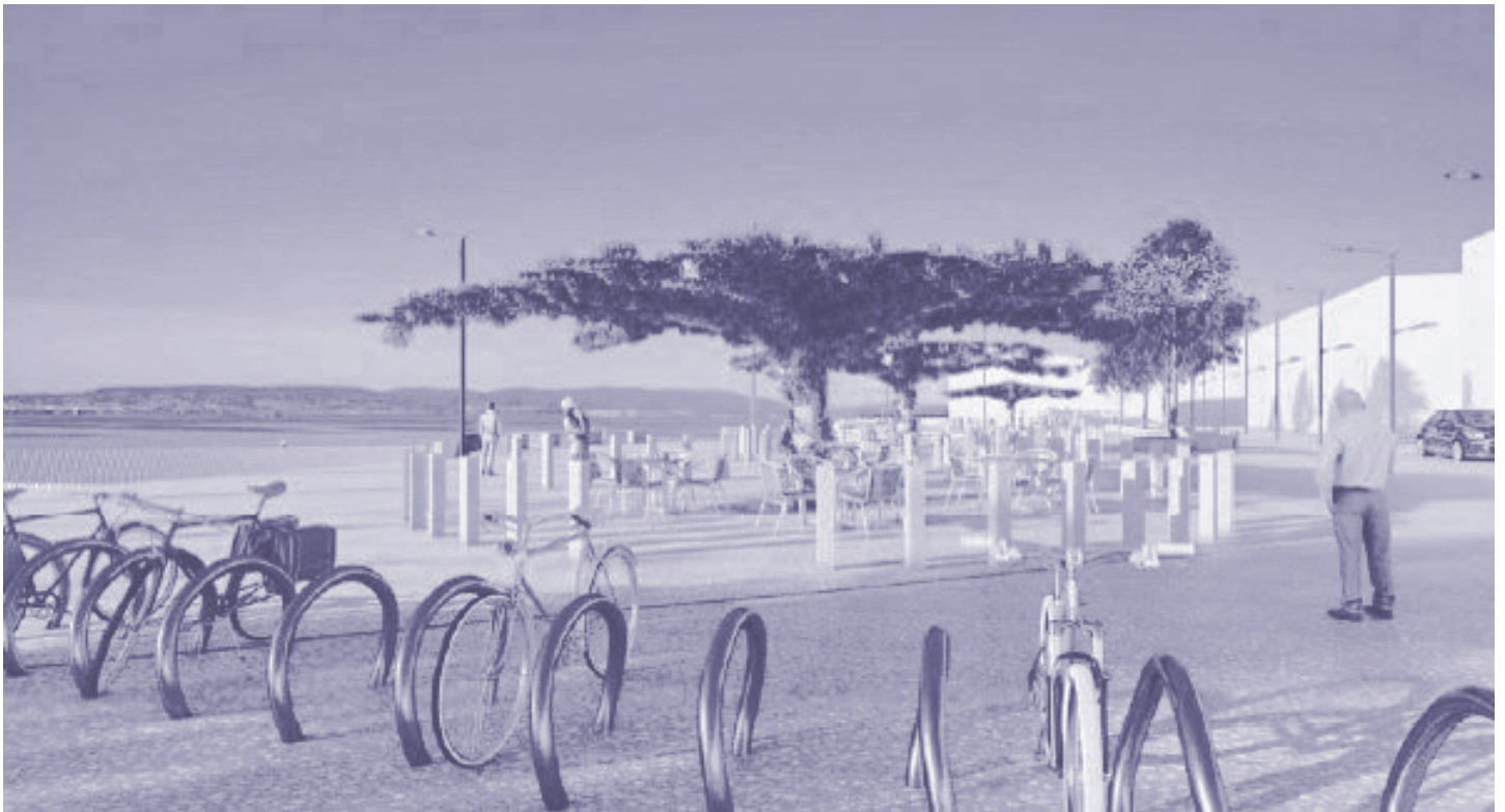
Fig. 4 – Urban Follie in the waterfront of Bueu (García Fueyo, 2021).