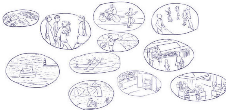
Fig. 2 – Urban activities in waterfronts (García Fueyo, 2021).

a) Quality of life: providing recreational activities, promoting a variety of mixed-uses and revitalizing the urban centers, strengthening sports equipment, leisure and green spaces;