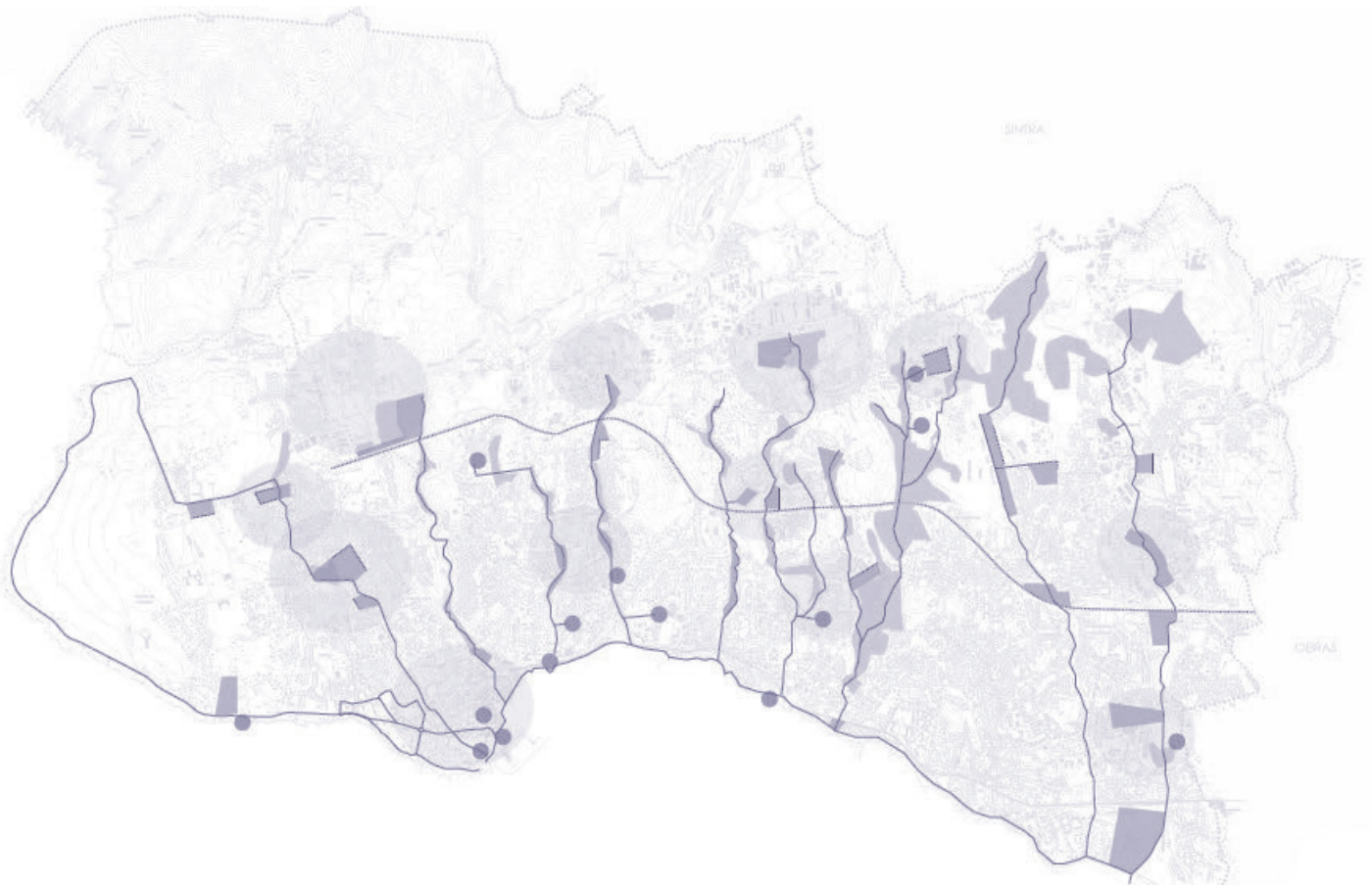
Fig. 1 – Sustainable and Urban Ecology Proposal for Cascais, Lisbon (Sellari, 2016).