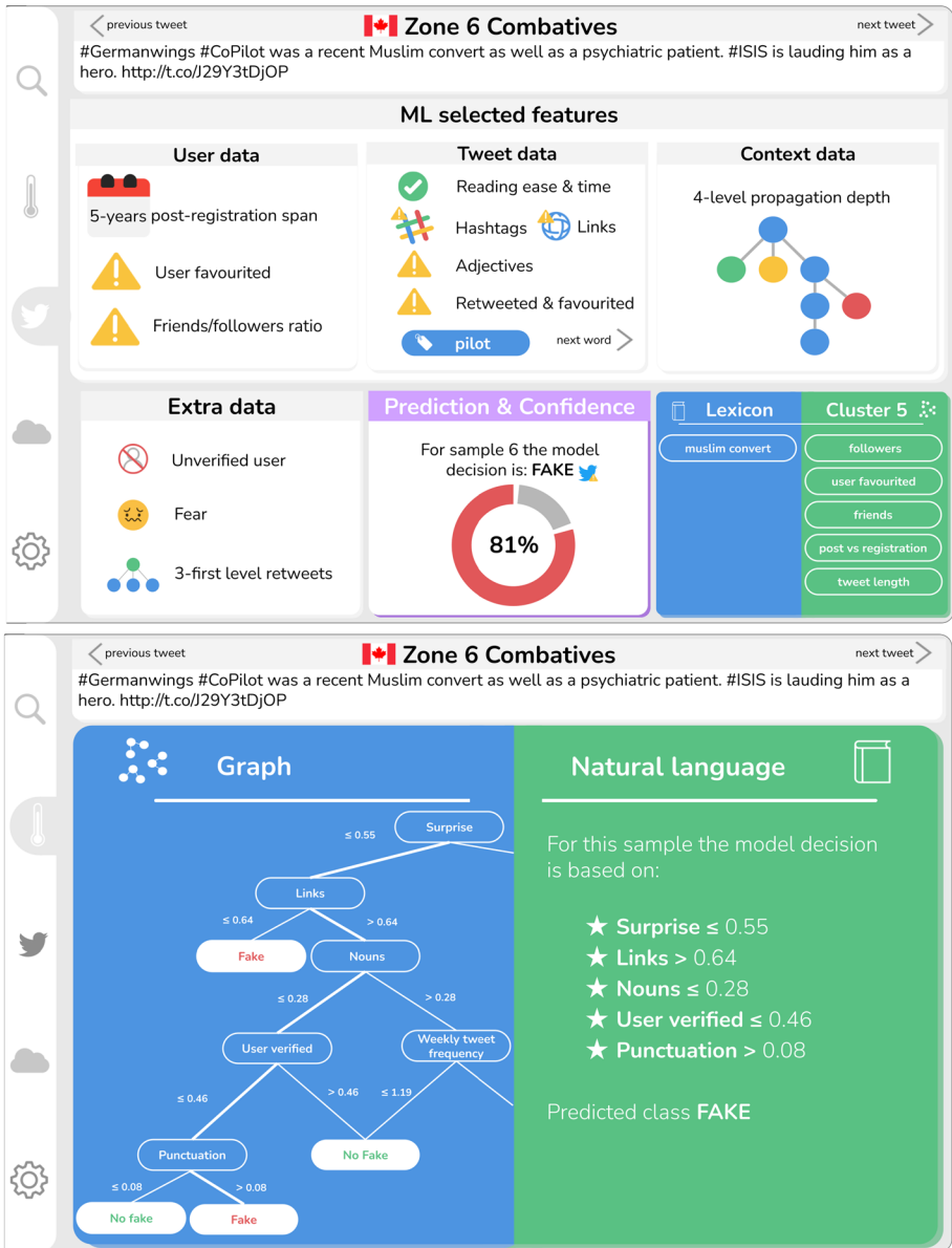
Fig. 2 Explainability dashboard comprising: (i) selected features from the content, context, and creator, (ii) the prediction, (iii) representative entries of the frequency-based lexicon and the clustering procedure, and (iv) the decision path and its natural language transcription

isolating potential malicious accounts as well as extend the research to related tasks like stance detection, by exploiting new creator-, content- and context-based features.